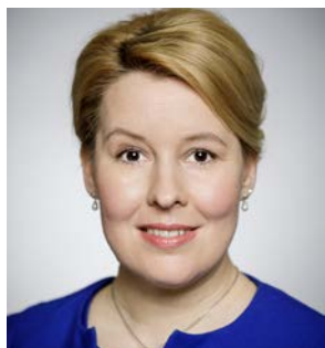
Dr. Franziska Giffey

Helena Dalli is the first EU Commissioner for Equality, serving since December 2019. Her role is to deliver on the Union of Equality chapter within the Political Guidelines of President von der Leyen by strengthening Europe's commitment to equality and inclusion in every sense.